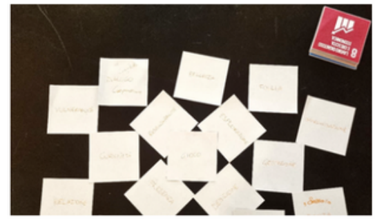
PICTURE 6 - OVERTURNING THE 2030 AGENDA: NEW SLOGANS FOR THE SDGS, AS PROPOSED BY A PARTICIPANT DURING THE COLLABORATIVE ACTIVITY

2) On the second day, a collaborative activity dedicated to the SDGs was carried out, in which each participant was explicitly asked to select and present an SDG that, in their opinion, had priority over what was discussed on earth/soil, and best gave back their point of view and specific interest of the attendee (Picture 5). In this activity, we have found in the artists a feeling of discomfort and limitation to creativity, generated by conforming to slogans distant from the emotions of a creative activity such as the theatre work, to the point of one participant wanting to overturn the Agenda and proposing completely new objectives (Figure 6). On the other hand, scientists have shown love and hate-sentiment towards a limited, limiting, and homogenized glossary of objectives, which nevertheless brought sustainability issues to the attention of the wider society, building a common glossary to catalyze different capacities around urgent environmental and social challenges.