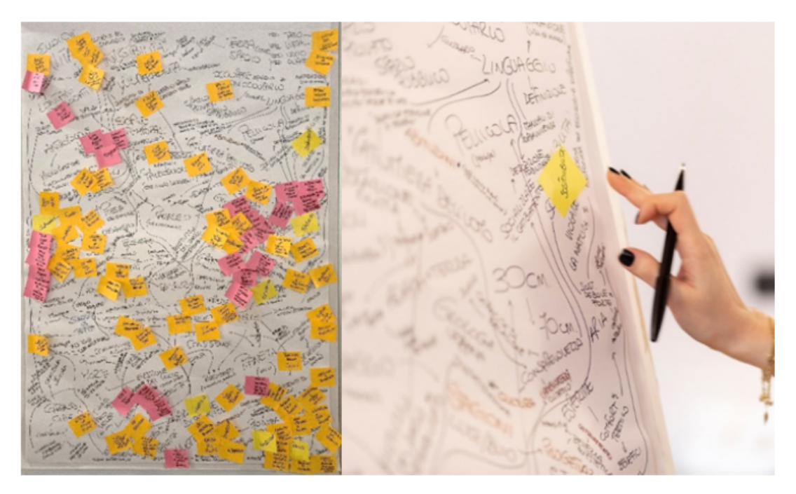
PICTURE 3 - THE LIVE BOARD COLLECTING CONCEPTS, KEYWORDS AND CONNECTING TOPICS